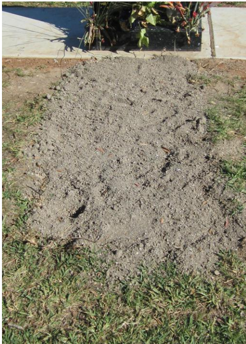
Stabilised grave covered in top soil in preparation for turf