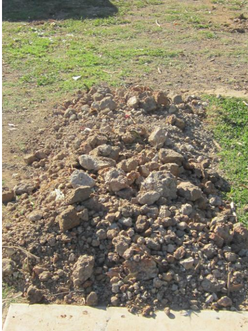
Recent Burial backfilled with excavated soil