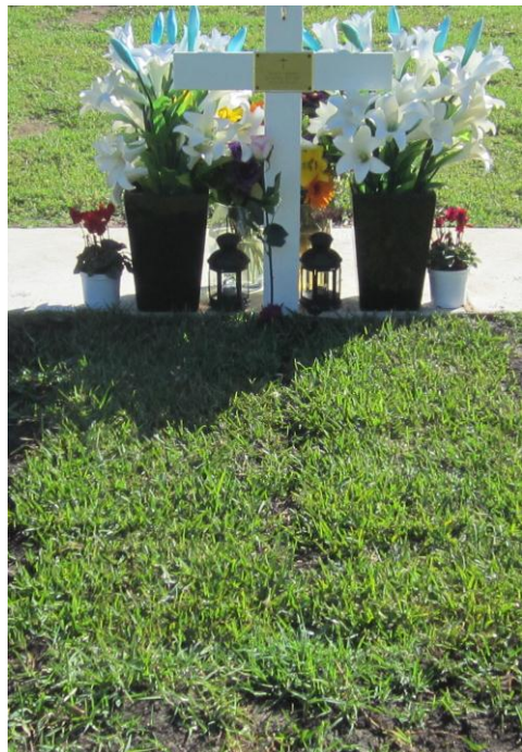
Completed turfed grave