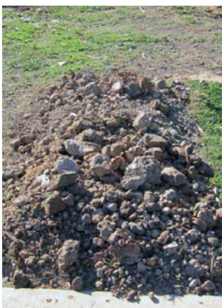
Recently backfilled grave

Please note we do not use machinery to compact soil as this could damage caskets or coffins. We will supervise the event to ensure that respect for the deceased person is maintained and that public health is protected.