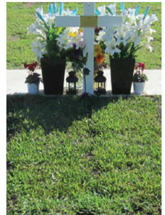
Grave finalised with turf