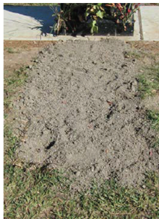
Loose soil settling into place (grave subsidence)